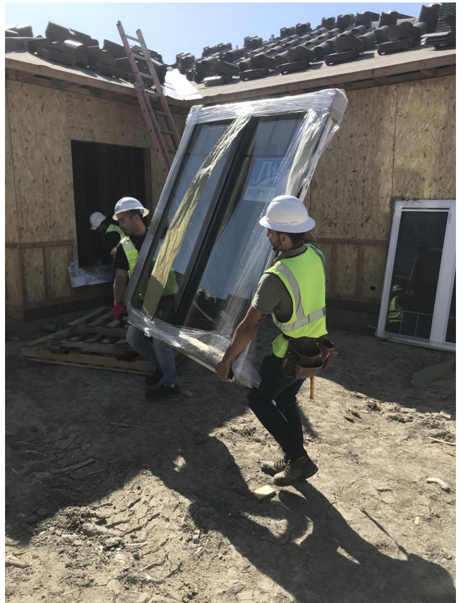
Cottage Window Install