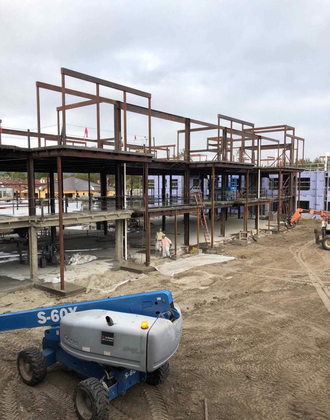
B4 Structural Steel Erection