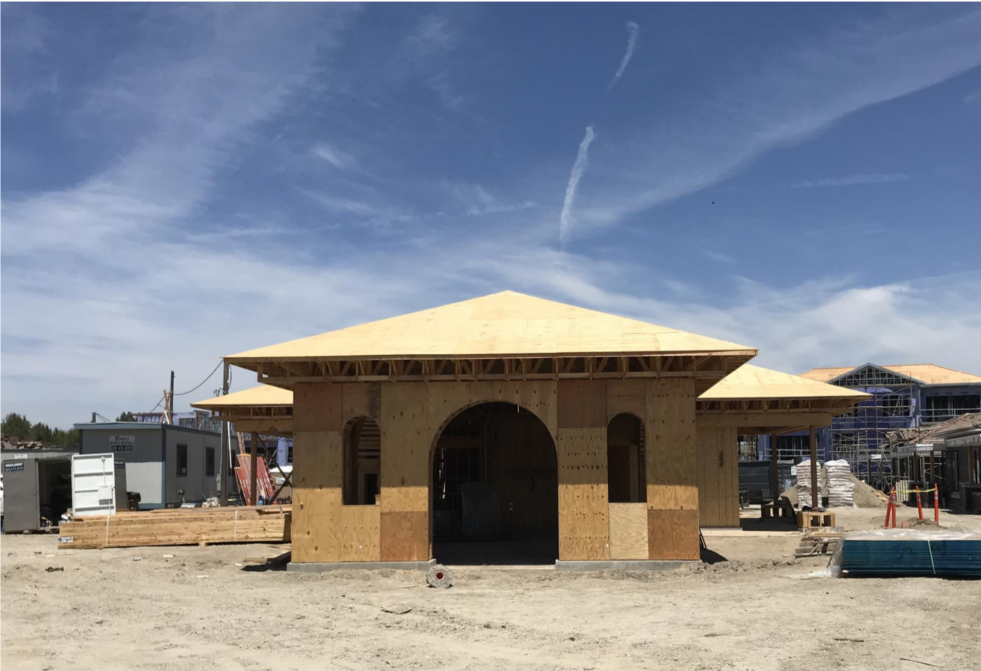
Pool House Wall and Roof Framing