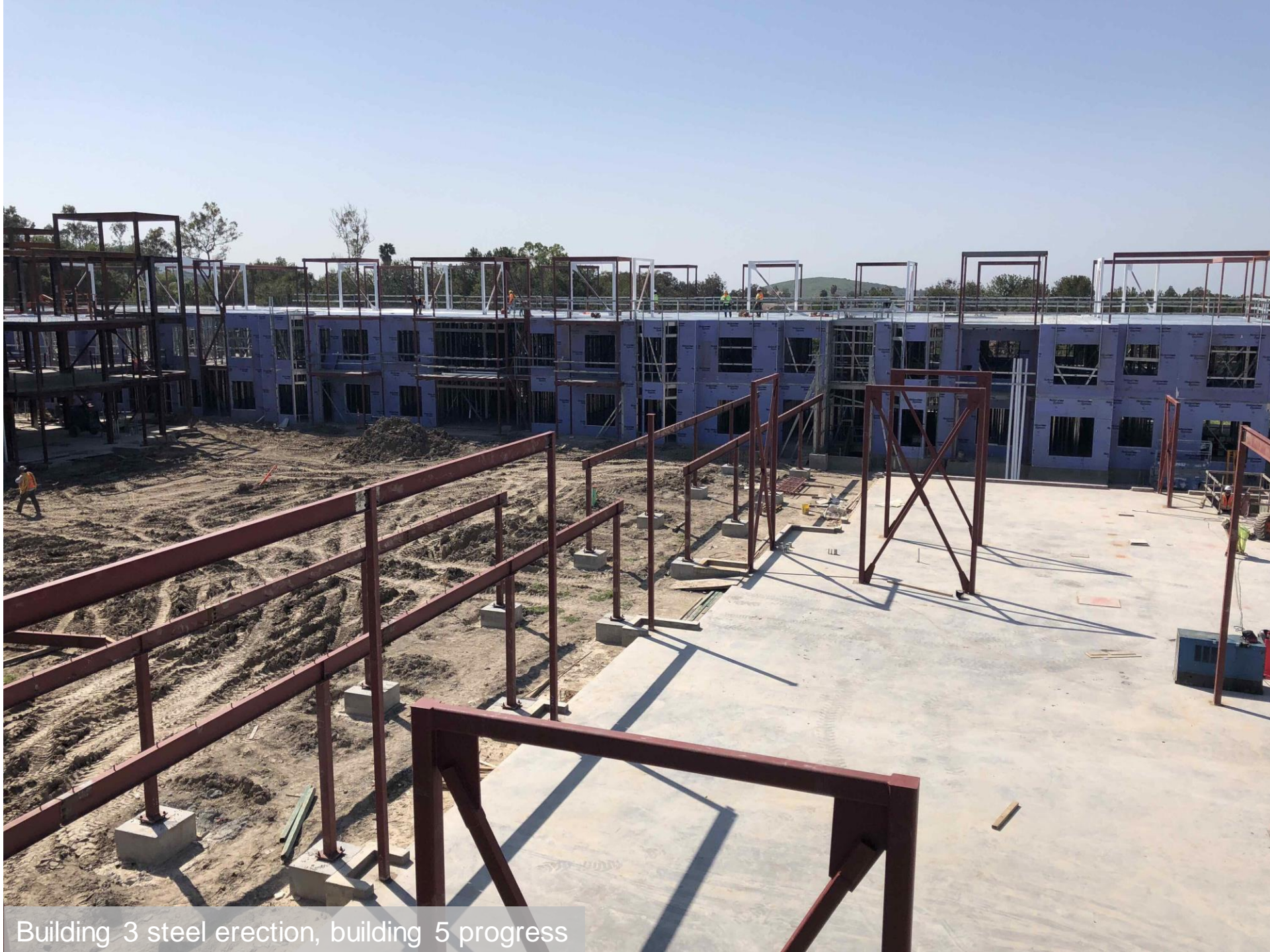
Building 3 steel erection, building 5 progress