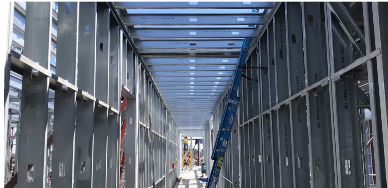
B4 Steel erection and fire resistive coating