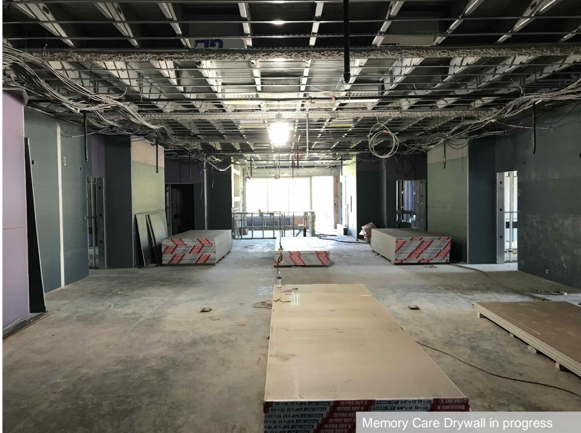
Memory Care Drywall in progress