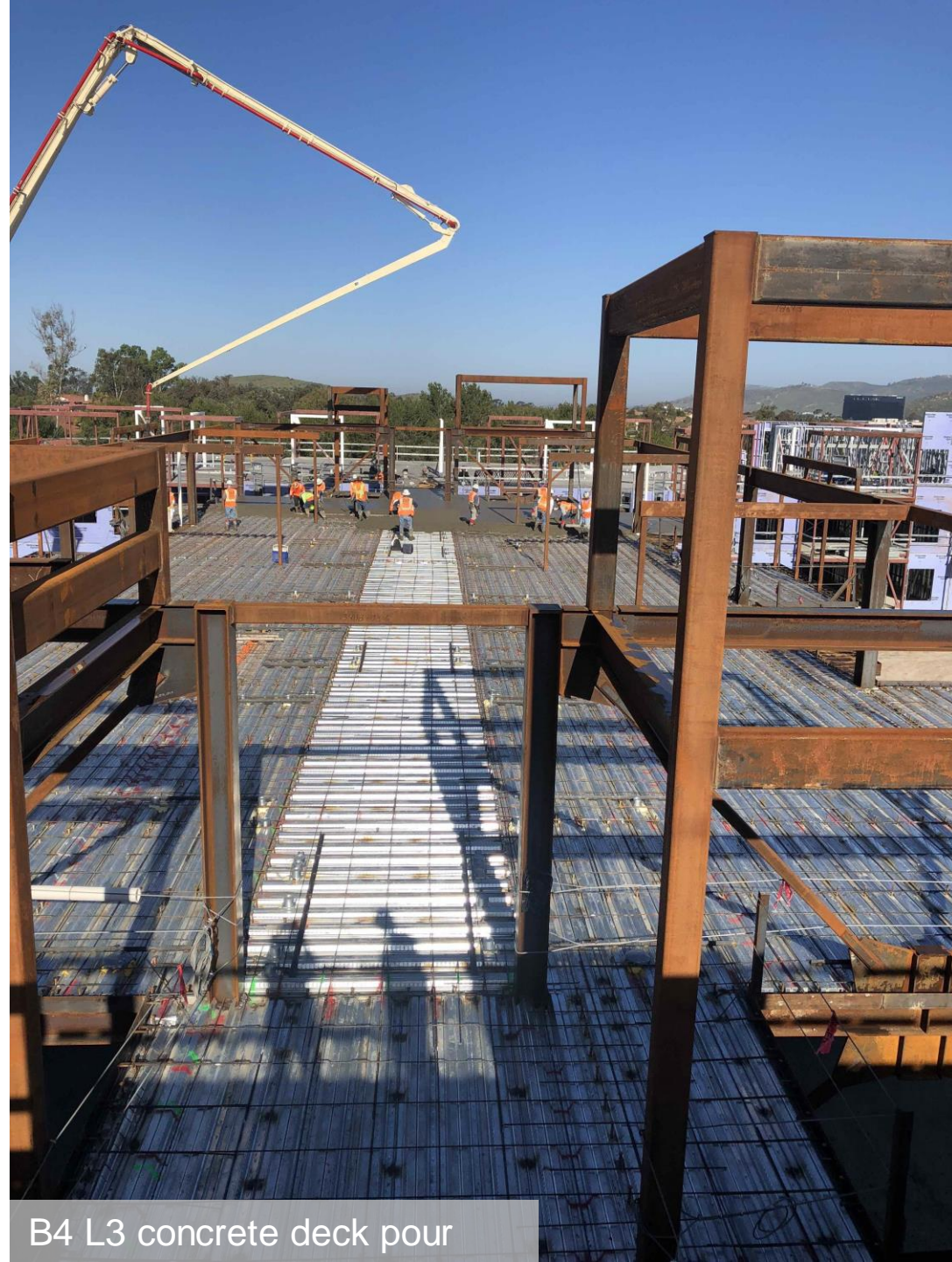
B4 L3 concrete deck pour