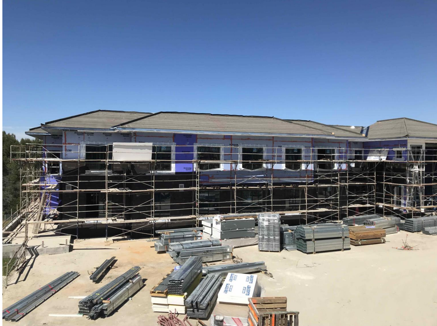
B2 Exterior Skin Progression