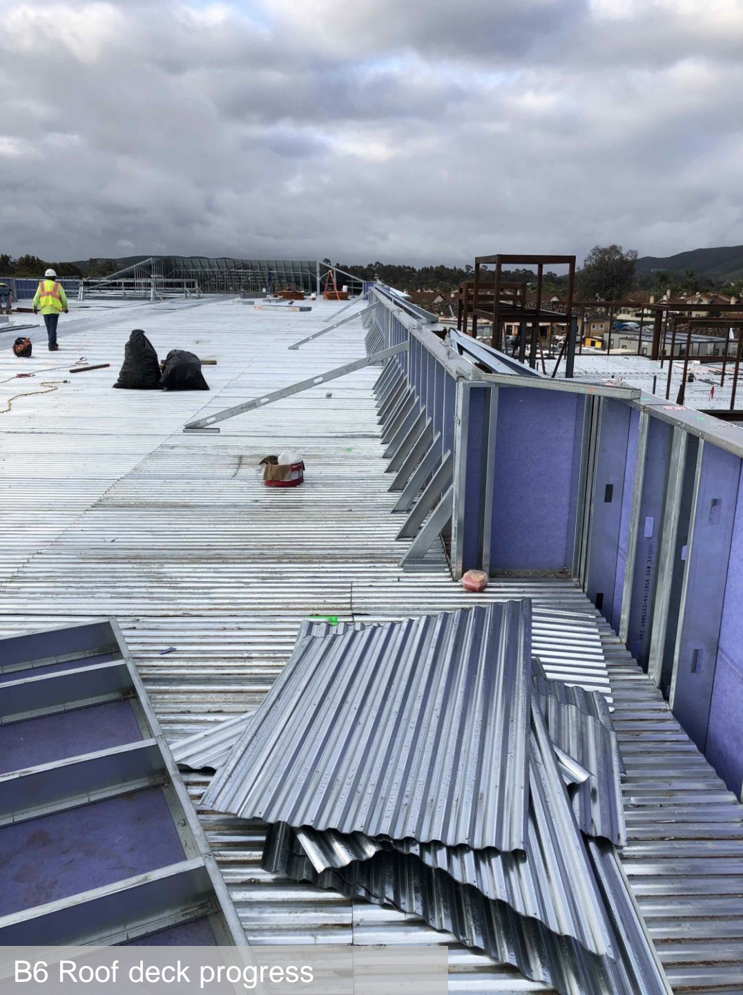
B6 Roof deck progress