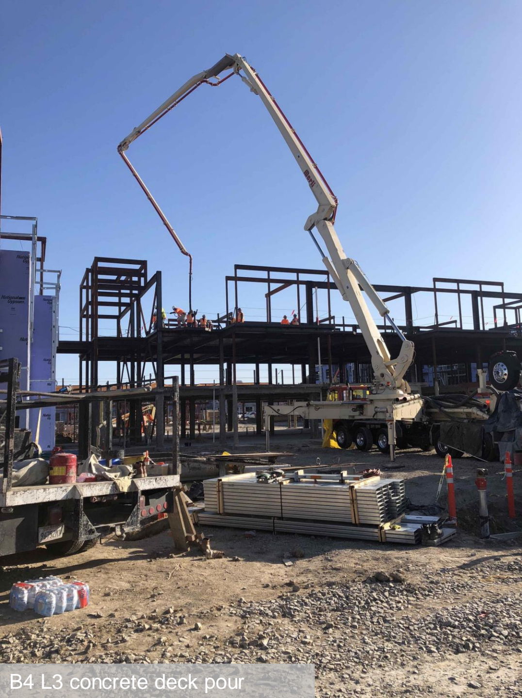
B4 L3 concrete deck pour