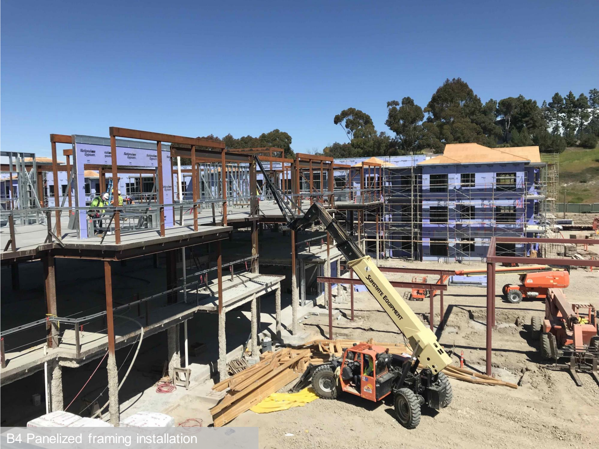
B4 Panelized framing installation