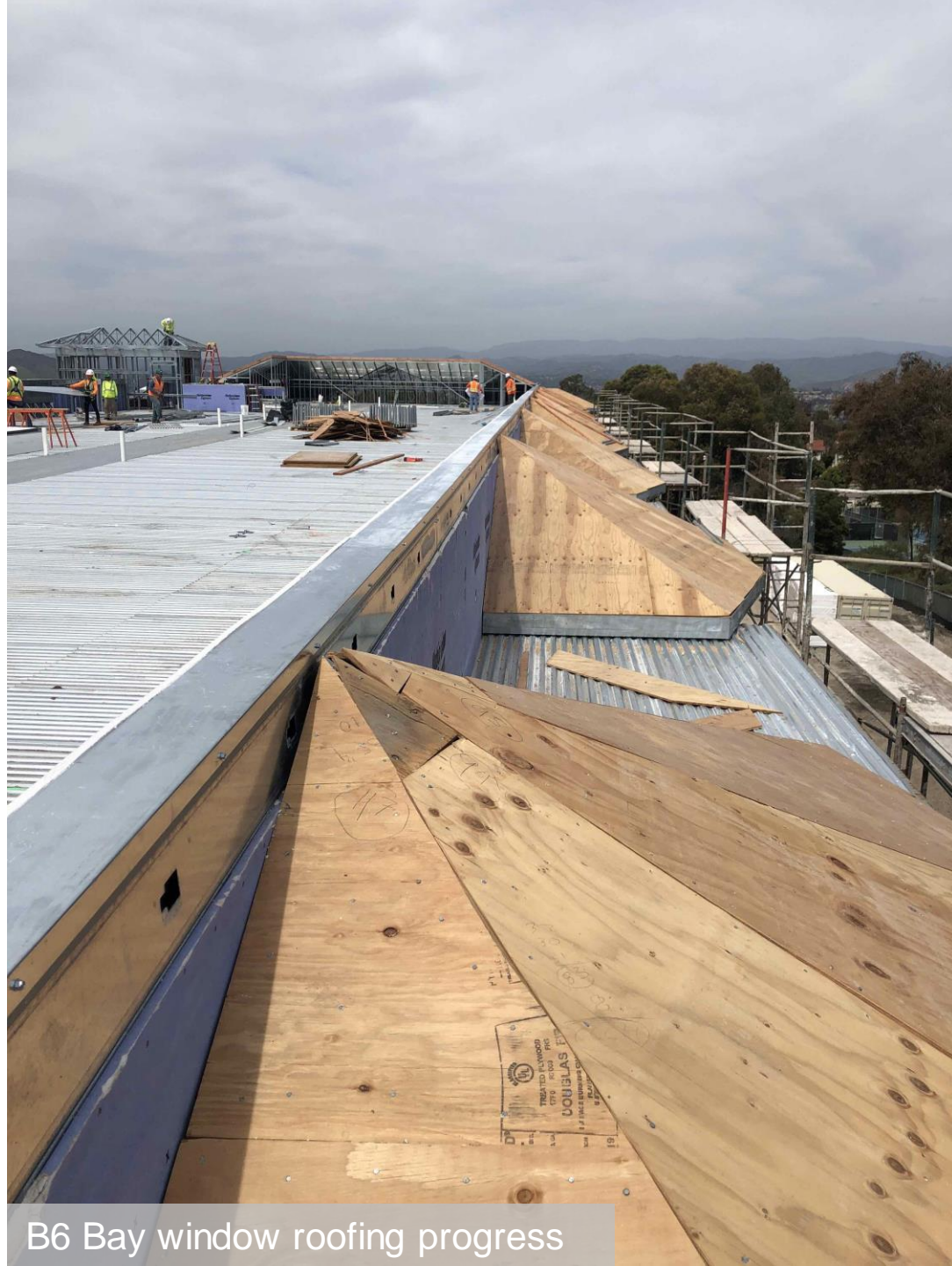
B6 Bay window roofing progress