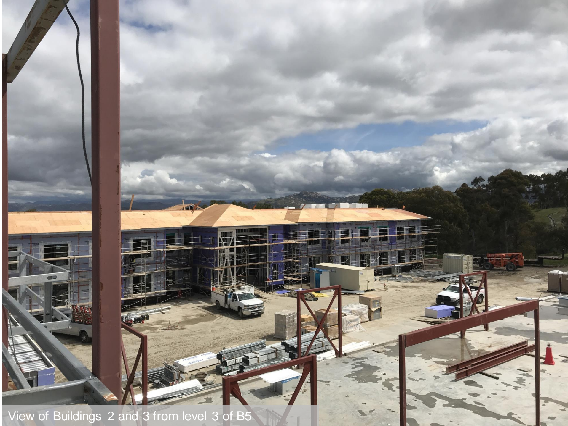
View of Buildings 2 and 3 from level 3 of B5