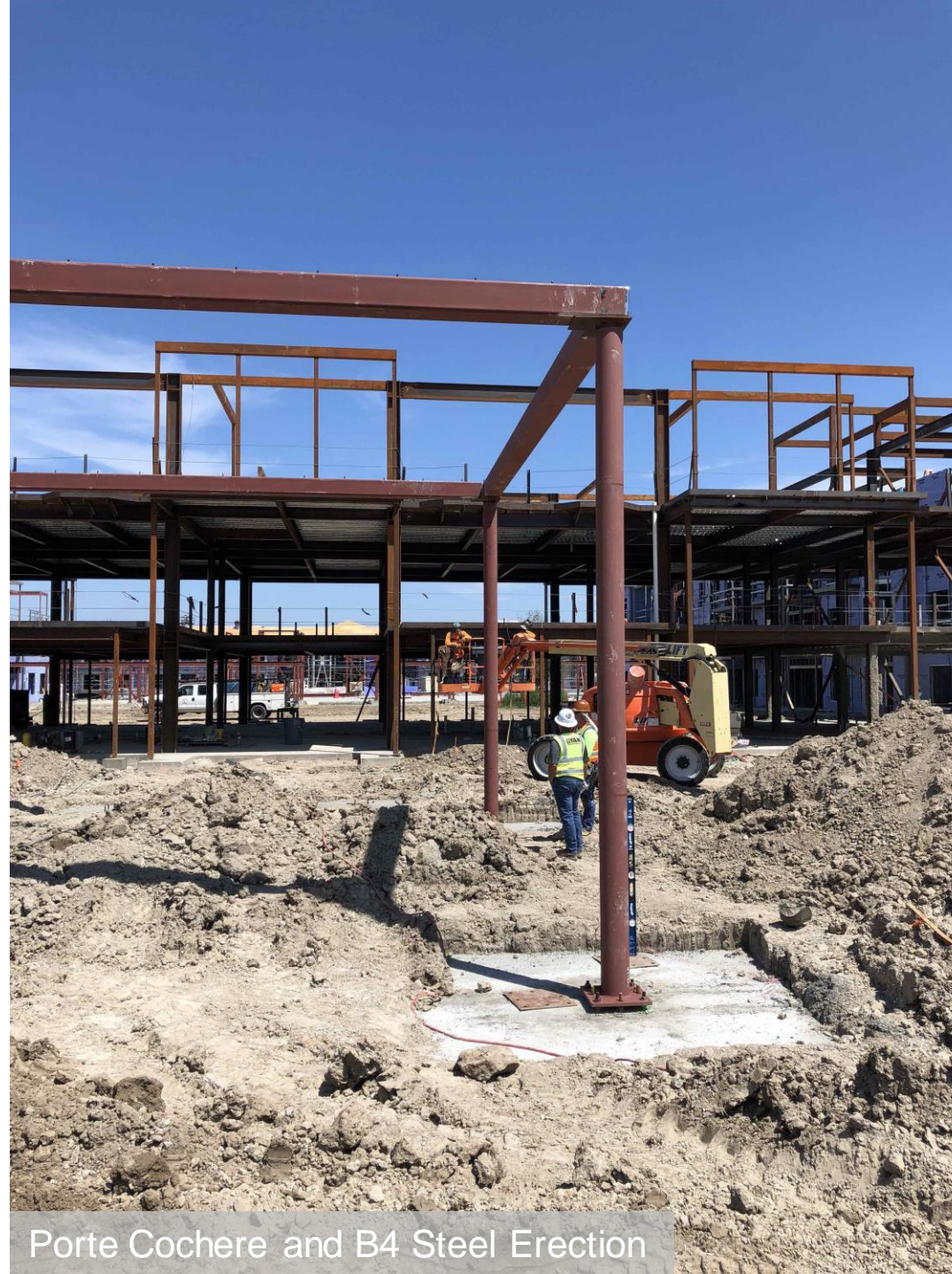
Porte Cochere and B4 Steel Erection